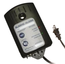
Pumping station Alarm box

In the event of a power failure, the alarm system continues to function on an emergency 9-volt alkaline battery (not supplied). Using a rechargeable battery is not recommended.