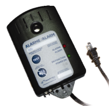
Pumping station Alarm box

In the event of a power failure, the alarm system continues to function on an emergency 9-volt alkaline battery (not supplied). Using a rechargeable battery is not recommended.