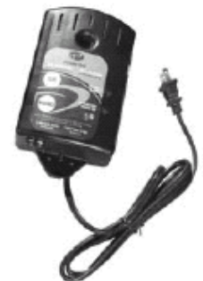
Alarm box for the pumping station