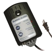
Pumping station Alarm box