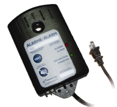
Pumping station Alarm box