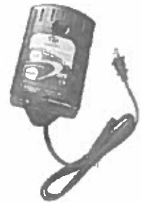
High water level and UV lamp malfunction alarm

During power failure, the alarm system will still be operational via a 9 volt battery back up. When the battery is low, you will hear short beeps every minute. It is time to replace it.