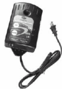
High water level and UV lamp malfunction alarm

During power failure, the alarm system will still be operational via a 9 volt battery back up. When the battery is low, you will hear short beeps every minute. It is time to replace it.