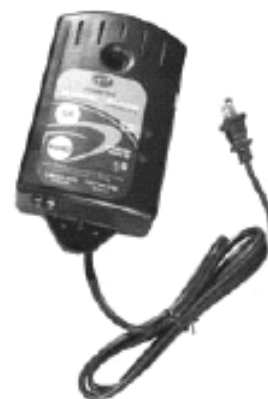
High water level alarm for pumping

NOTE: Replace the emergency battery every 12 months and each time the alarm comes on or there is a power failure. When the battery is low, short beeps will be heard at a frequency of one beep per minute. Replace the battery immediately when this occurs.