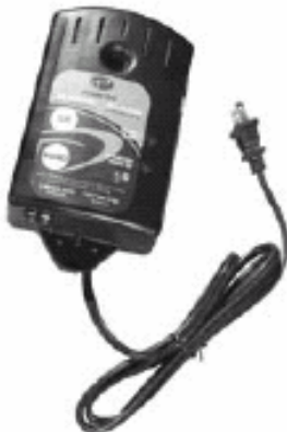
High water level alarm for pumping station

The “TEST” button allows checking if the alarm system is working properly. When the test is done, the red light and the audio alarm should come on.