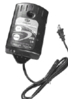
Alarm box to be installed inside the residence