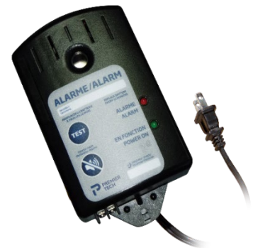
Pumping station alarm box