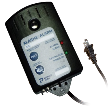
Pumping station alarm box