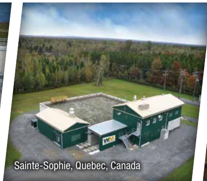
Sainte-Sophie, Quebec, Canada