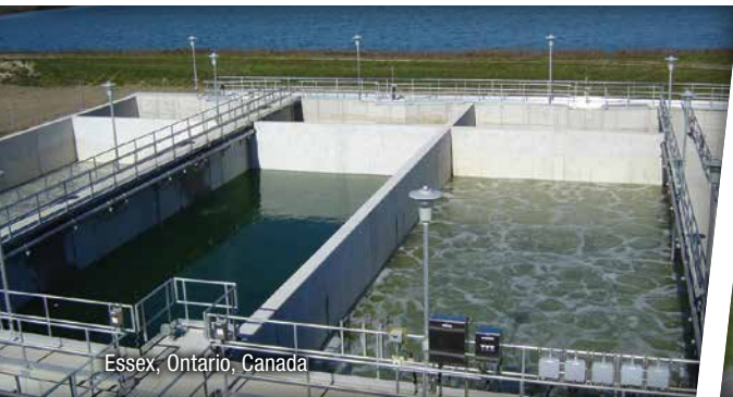
Essex, Ontario, Canada