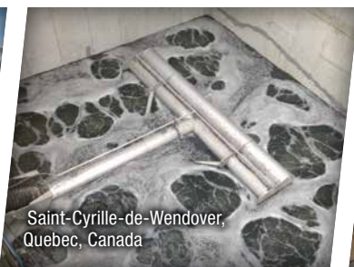
Saint-Cyrille-de-Wendover, Quebec, Canada